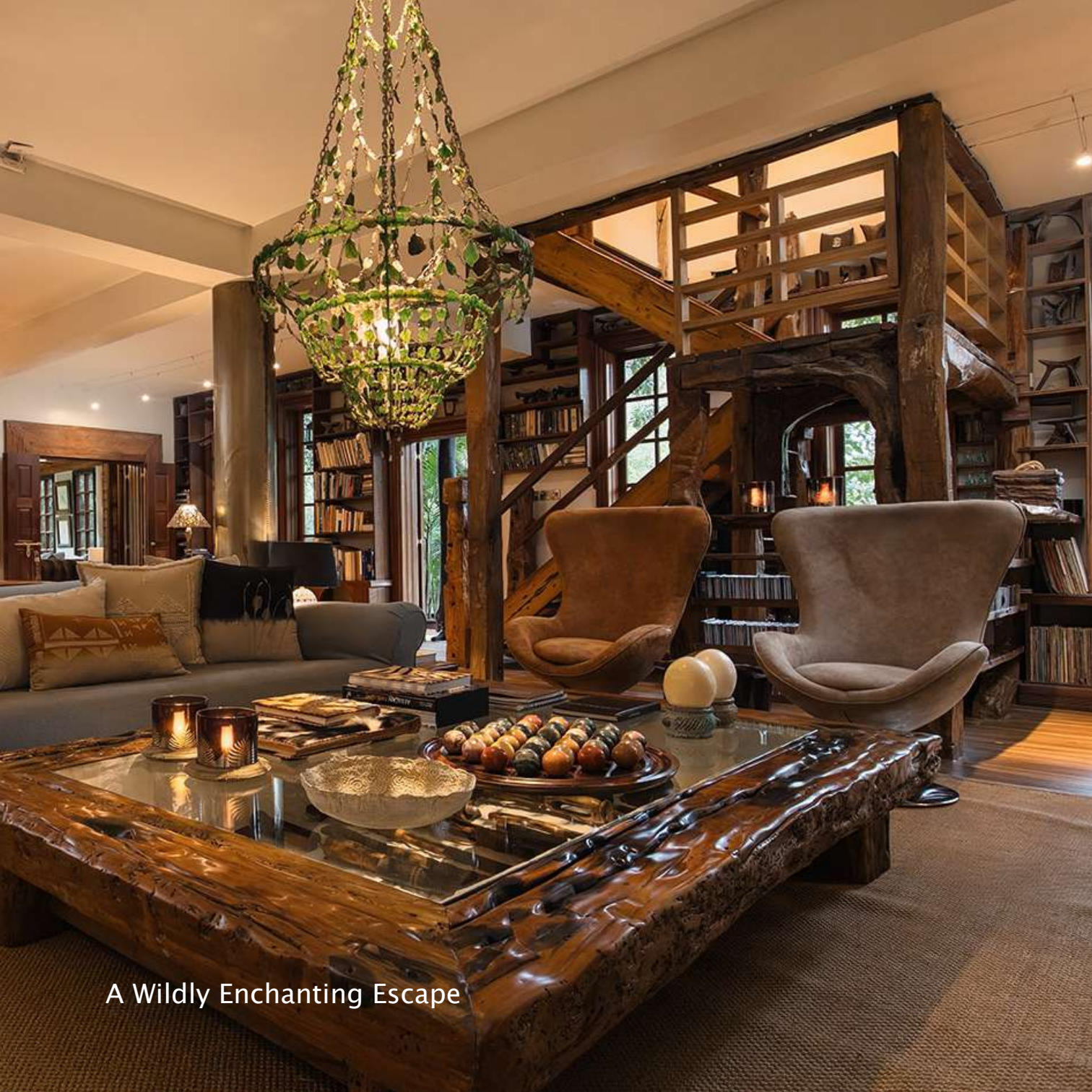
A Wildly Enchanting Escape